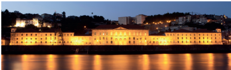
Alfândega Congress Center