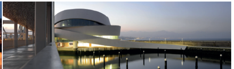
Leixões Cruise Terminal